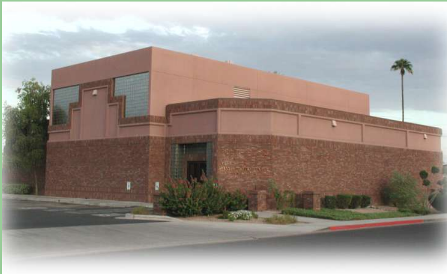
Mesa Arizona FamilySearch Library