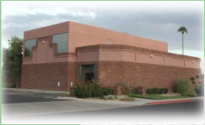
Illustration ("The Melville Method")